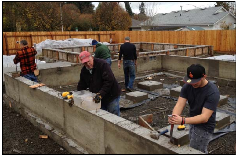
Valley family and friends participating in a recent Habitat for Humanity build.