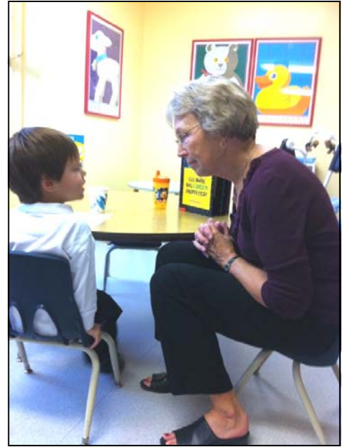
Right: Little ones are the center of attention at Valley's Nursery classroom on Sunday mornings.