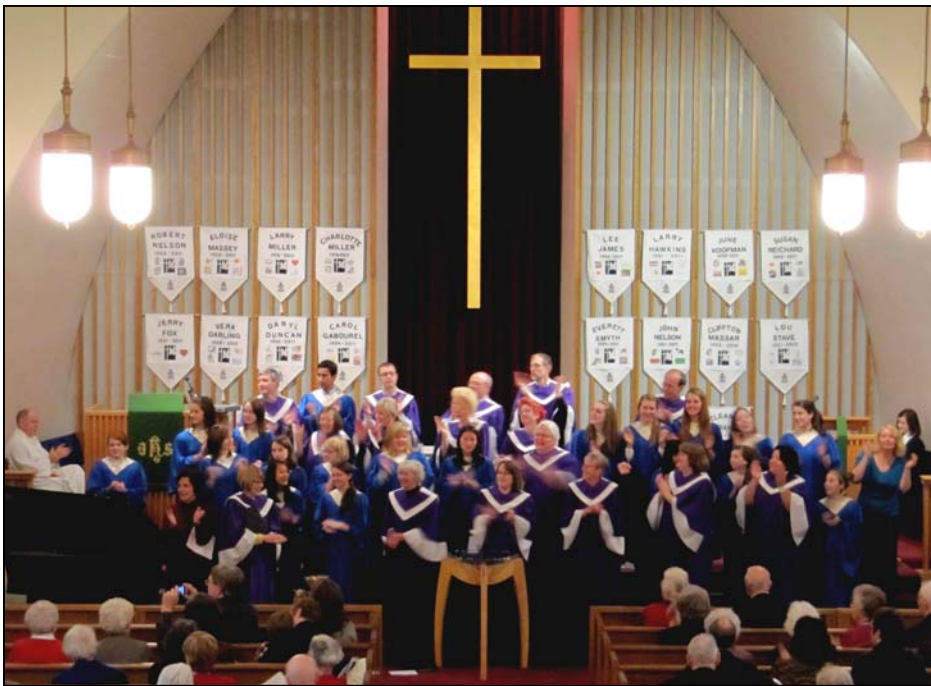
The Sanctuary and Youth Choirs on All Saints Sunday.