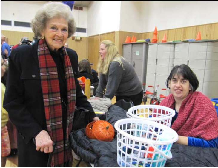
Many tables displayed what mission dollars help support at the recent Mission Market.