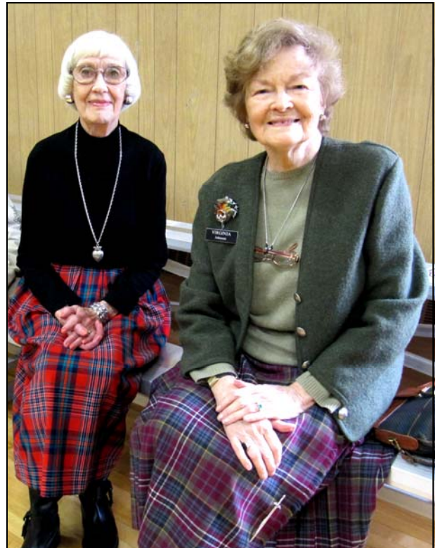
Many wore their tartans with pride on Kirkin' o' the Tartan Sunday.