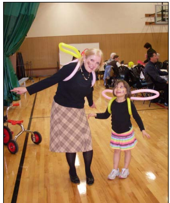
Right: Butterfly wings, along with other creations, were made by a balloon artist at the Fall Congregational Brunch.