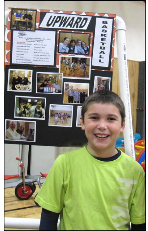
Left, above, right: The annual Mission Market highlighted projects that Valley's mission dollars support. This was a great opportunity to make a donation in honor of someone special and do some early Christmas shopping.