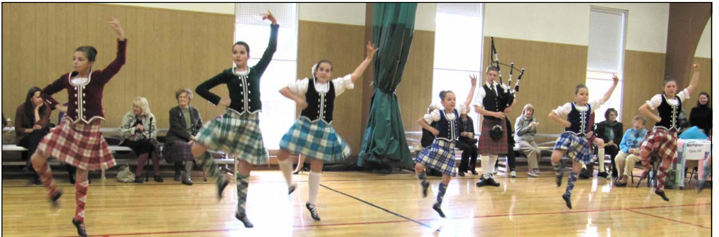
A piper and Scottish Highland dancers performed during coffee hour on Kirkin' o' the Tartan Sunday.