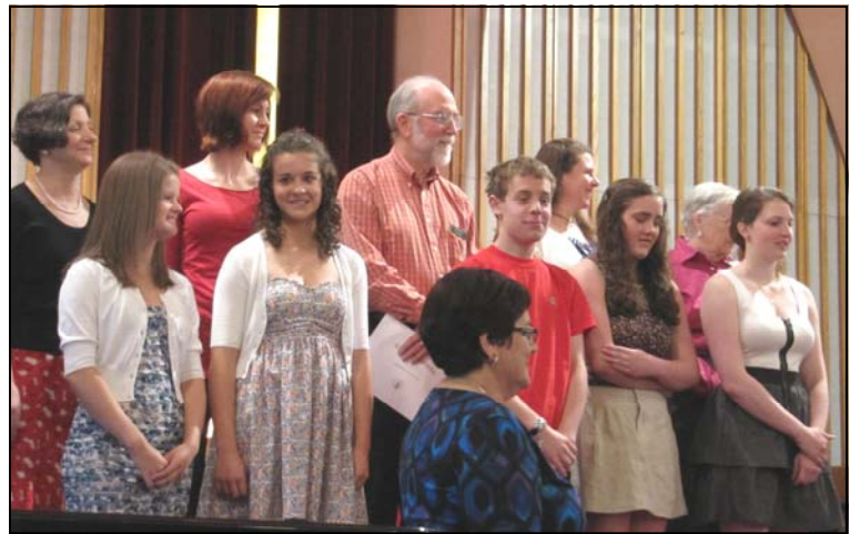
Communicants class with elders.