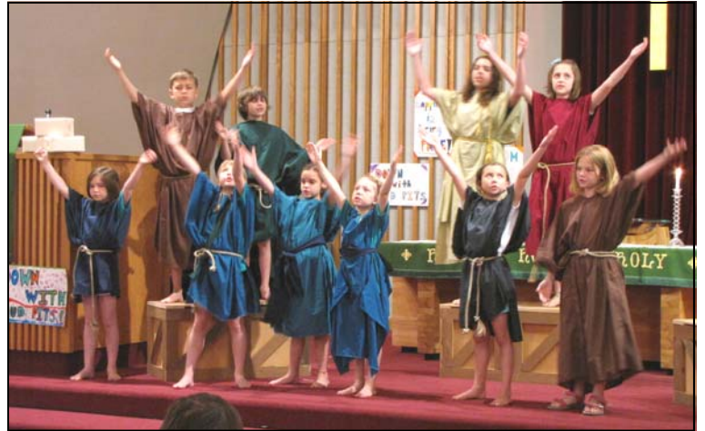
A dramatic moment in the Music and Drama Camp presentation of "Moses and the Freedom Fanatics."