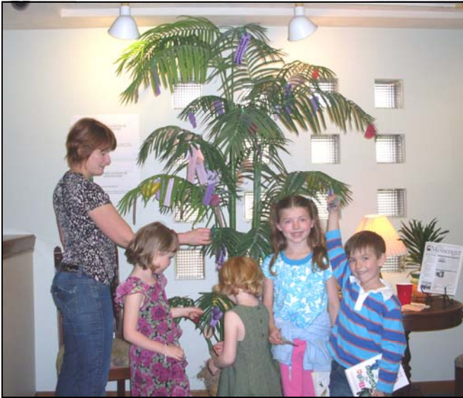
Vacation Bible School's "Giving Palm Tree" in Valley's entrance hall. Stop by and select a snack donation tag for specific snack items still needed.