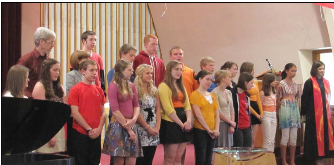
High School mission trip commissioning.