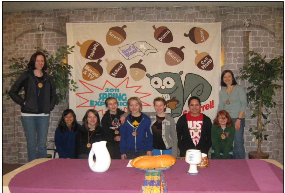
Spring Explosion group in front of a mural we brought with us for stage decorations. The theme was "Squirrel," regarding things that distract us from a closer relationship with God.