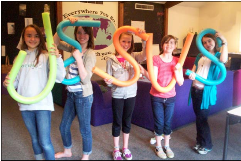
A group of Middle School girls during our "Fun-Noodle Night" at the Youth House in May.