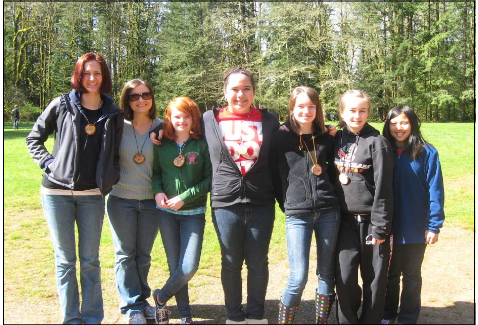
Part of the Valley group that attended the Middle School Spring Explosion Retreat in Corbett, OR. The weather was good, conversations were great, and lots of fun was had.