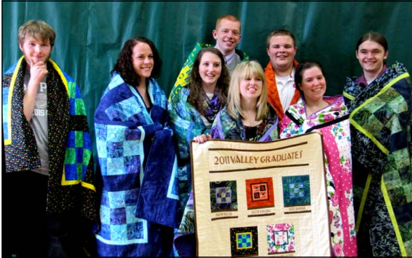
Valley's High School graduates were each presented with a handmade quilt on Graduation Sunday.