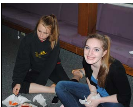
Enjoying a snack at youth group.

As the school year quickly winds to a close, our high schoolers remain busy and active at Valley, in the community, and beyond. May will be a month of preparation, hard work, and celebration. Thank you to our Valley family for the various ways in which you continually join with and support us.