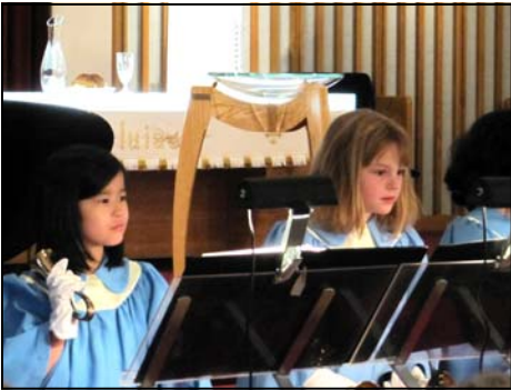
The Royal Ringers Bell Choir played "Festive Praise" for worship.