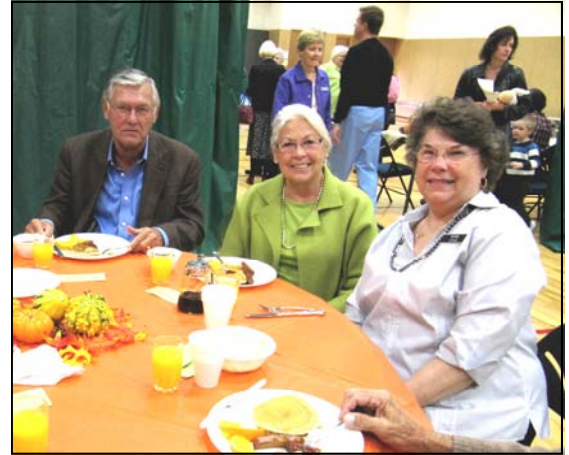
Enjoying fellowship at the recent pancake breakfast benefitting youth mission.