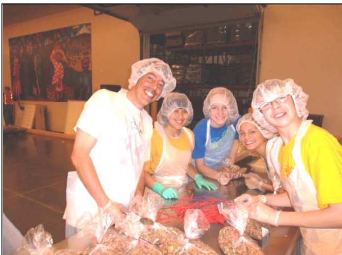
Middle School Youth and Adult Advisors bag pinto beans into 2-pound bags at the Oregon Food Bank in October!