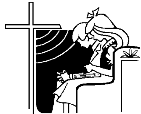
Left: Third graders with their Bibles that were presented to them during Worship.