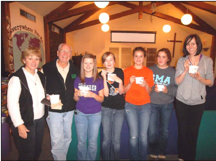
Some of the High School Youth and Youth Advisors after a "Frozen Yogurt Run" during a Sunday night FAMILY meeting.