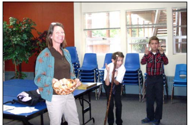
Above and left: Children's Sunday School has resumed. Kindergarten through Fifth Graders rotate with their class groups to different activities each Sunday. See article on this page for more information.