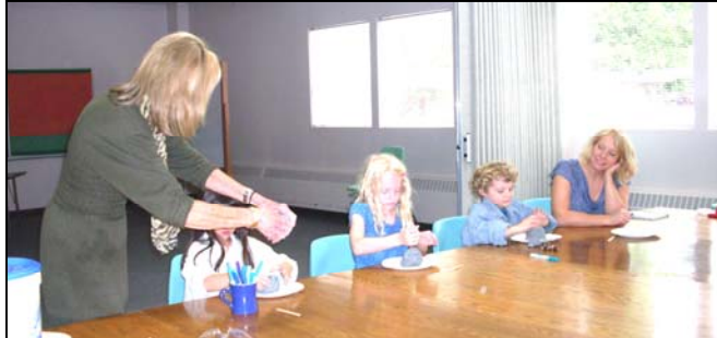
Making crafts during Children's Sunday School.

Children's Ministries is seeking gently used household items, office supplies, unopened beauty products and toiletries for purchase by children as Christmas gifts for family and friends. Drop your donations in the basket in the balcony landing. Thank you.