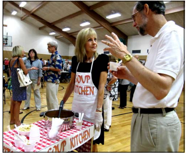
Many Valley missions were represented at the recent Bring a Friend to Church Sunday and Fall Kickoff, including the Soup Kitchen (above) and Fellowship Committee (below).

We do hope you find the emails helpful; please let us know if you have any questions.