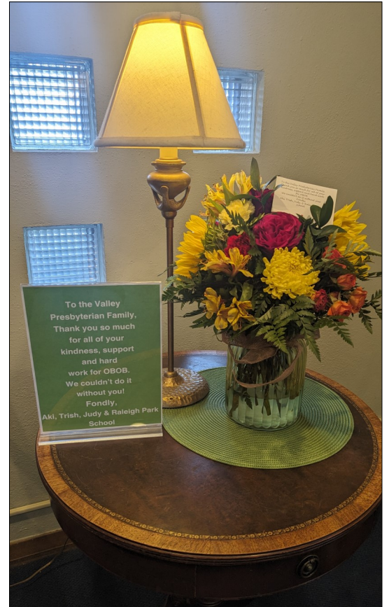
Right: Thank you flowers from Raleigh Park School.