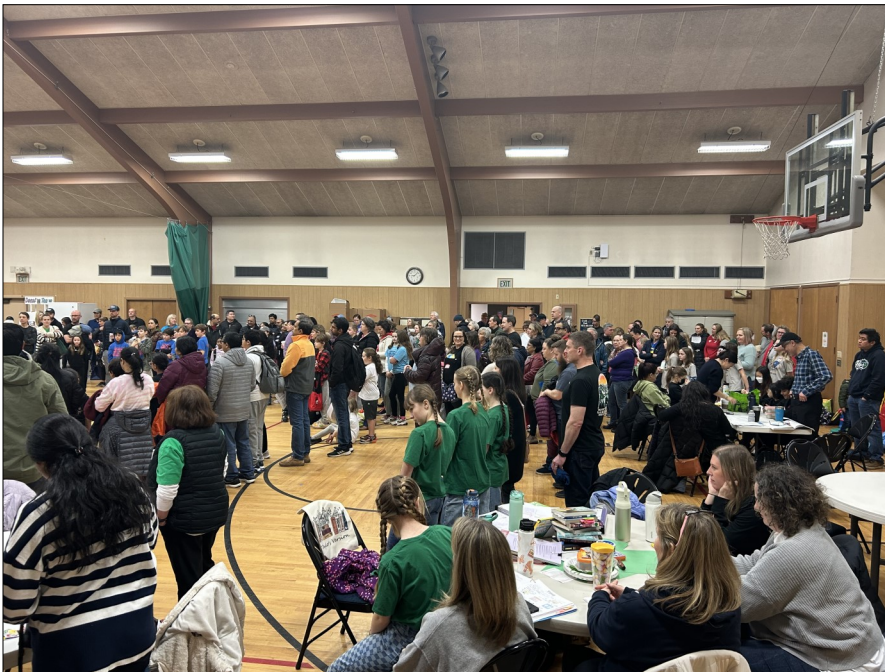
Above: Teams and families gathered in Valley's gym for OBOB.

Valley hosting the tournament made it possible for BSD students to compete and allowed us to expand our support of community partners as part of our three year vision.