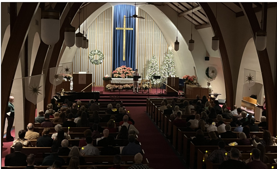
Electric candles were brought out during the Christmas Eve service.