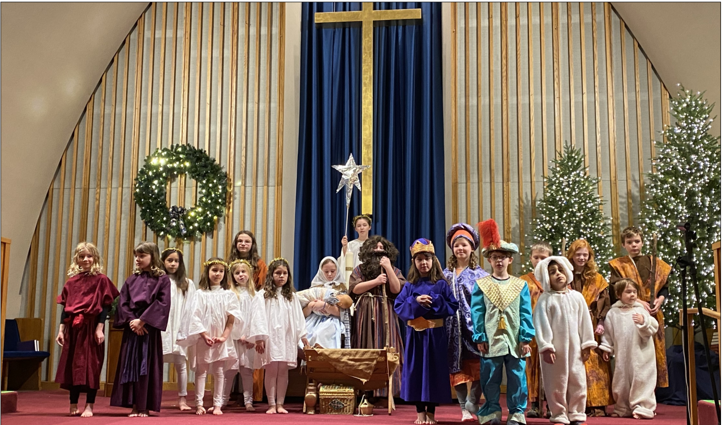
The cast of the Nativity Play.

As Transition Projects gets ready for another year, there are a few changes. Capacity will be back up to 90 men in January. They no longer have a vaccine mandate for folks that want to serve onsite. Options are to serve the prepared meals or drop the meal off at Bud Clark Commons. VCPC provides the meal the third Thursday of the month. We are looking for individual or groups to provide this service. All the months are open for 2024. Please contact MaryKay Rodman mkrodman@comcast.net if you can help out.