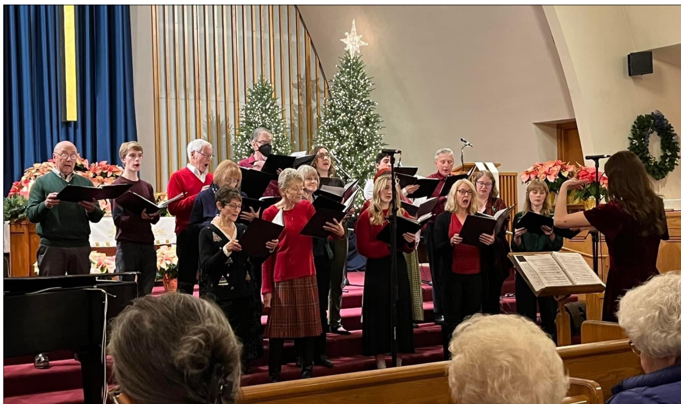
The Sanctuary Choir singing at the Christmas Eve service.