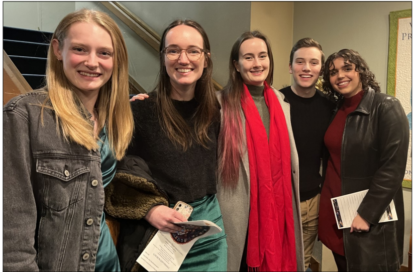
Valley college students reunite on Christmas Eve.