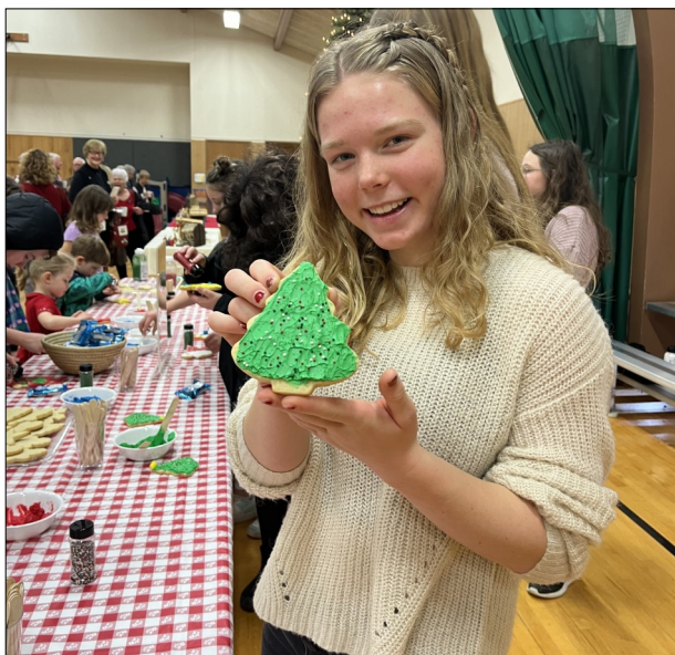
Having fun decorating cookies during coffee fellowship.