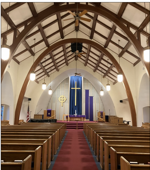
The Sanctuary is prepared for the Lenten season.