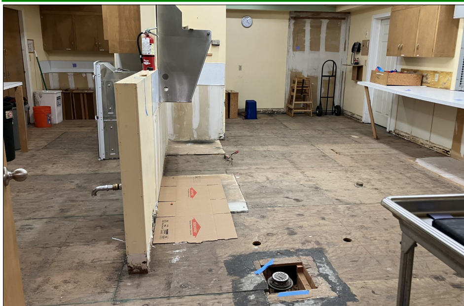
All the appliances and lower cabinets were removed in the upstairs kitchen due to the water damage from the recent ice storm.