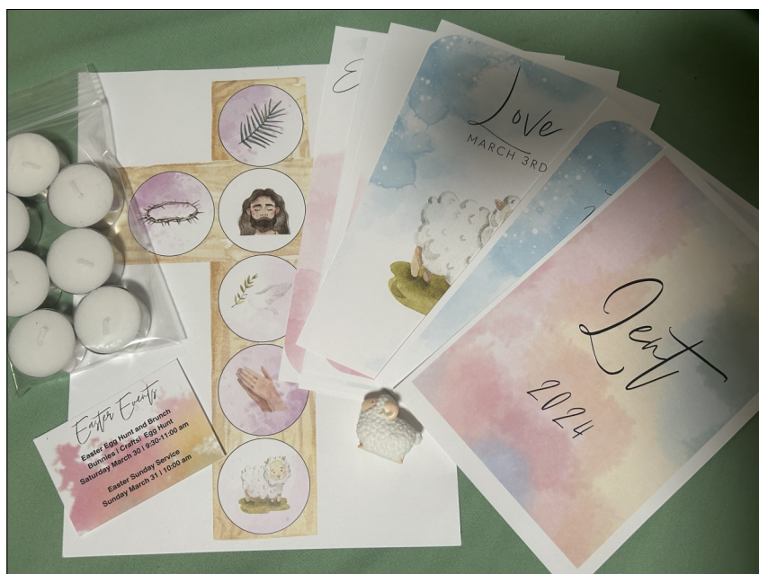
Lenten packets were handed out to families to use during Lent.

In the past ten years, this fund has awarded grants totaling about $200,000 to deserving applicants. No applications will be accepted past the April 1 deadline. Contact missionendowment@valleycommunity.org or the church office for a Mission Endowment grant application.