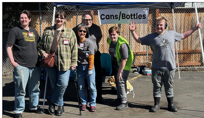
Youth--and youth supporters--collected bags of redeemable cans and bottles, which will help fund this summer's mission trip.