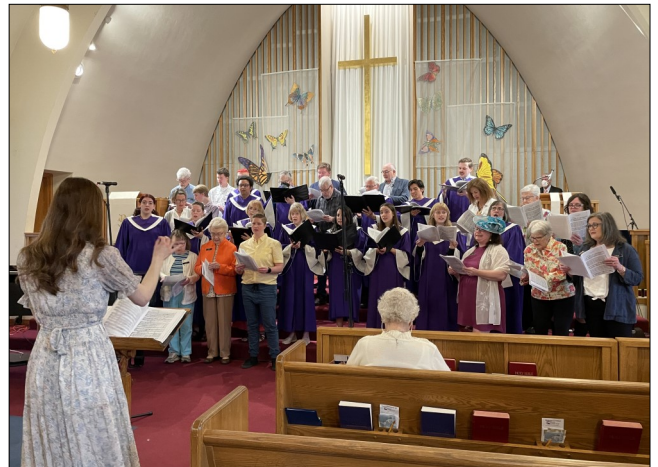
Congregants were invited to sing the "Hallelujah Chorus" with the Sanctuary Choir on Easter Sunday.