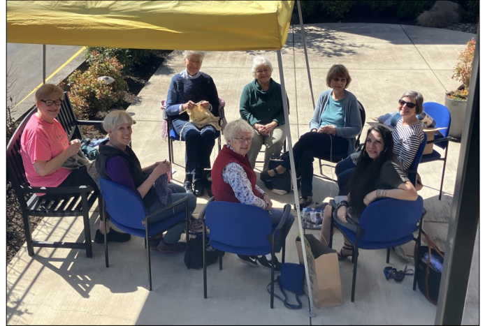
Members of the Prayer Shawl group enjoying the Spring sun.