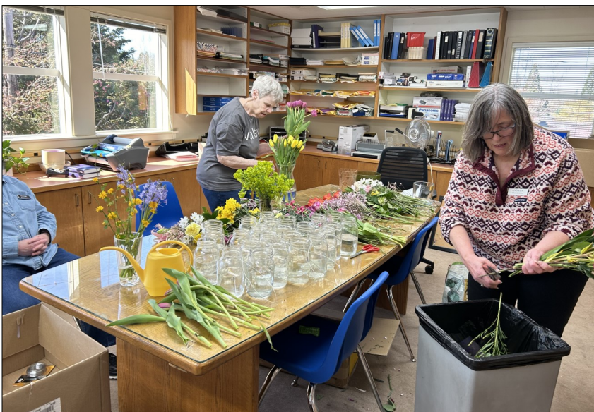
Above and right: Thank you to all of you who provided Mason jars and flowers to line the walkway on Easter morning. All of the bouquets were sent home with guests or for someone's neighbor.