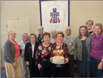
Celebrating 12 years meeting at Valley!

May 19 is when Together Women Rise at Valley will meet again. This month Rise will feature two different and previously funded nonprofit organizations, each receiving $50,000 for their grant request.