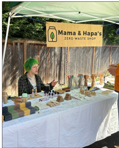
Earth care enthusiasts were interested in the array of products Mama & Hapa's Zero Waste Shop will be providing in Beaverton when it opens its new store in The Round.