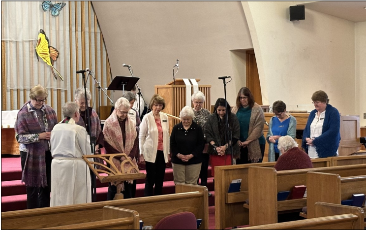
The Prayer Shawl Knitters received a blessing as they celebrated 19 years of ministry at Valley.